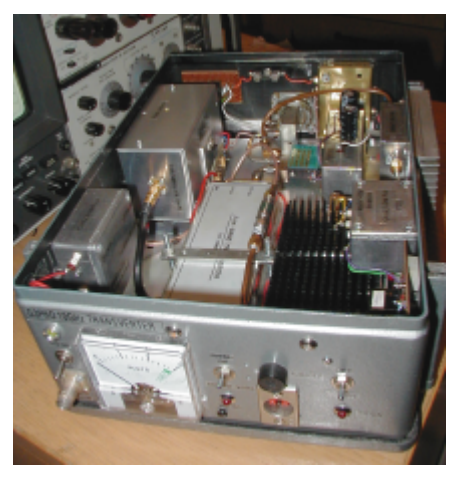
A 10GHz narrowband system based around a DB6NT basic transverter kit, a G8ACE designed ovened crystal oscillator kit and a DB6NT ready made 5W PA